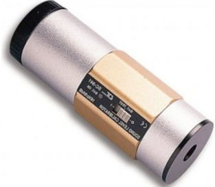
Figure 4: Example of a calibrator

First a bit of dry theory – In order for a sound level measurement to truthfully display the correct dB values, a calibration needs to be performed. This is typically done using a "calibrator", which is a handheld unit producing a very stable 1kHz tone at 94 or 114 dB. To calculate a SPL value the sound pressure at the microphone, measured in Pascal (Pa) is first converted into a voltage by the microphones preamp, and then sampled into digital values by the soundcard. The combinations of microphones, gain structure of the sound cards, and the software are many an unknown. As such it is not possible to know the relation between sound pressure and digital sample value without a proper reference. This is why a calibrator is needed. Inserting the microphone into the chamber of the calibrator will present the microphone with the 94 / 114 dB signal and the software can use its calibration routine to calculate the required calibration value. Once the calibration routine is completed the software should display a value of 94 / 114 dB at the slow / fast settings and 97 / 117 dB at the Peak C weighted value.